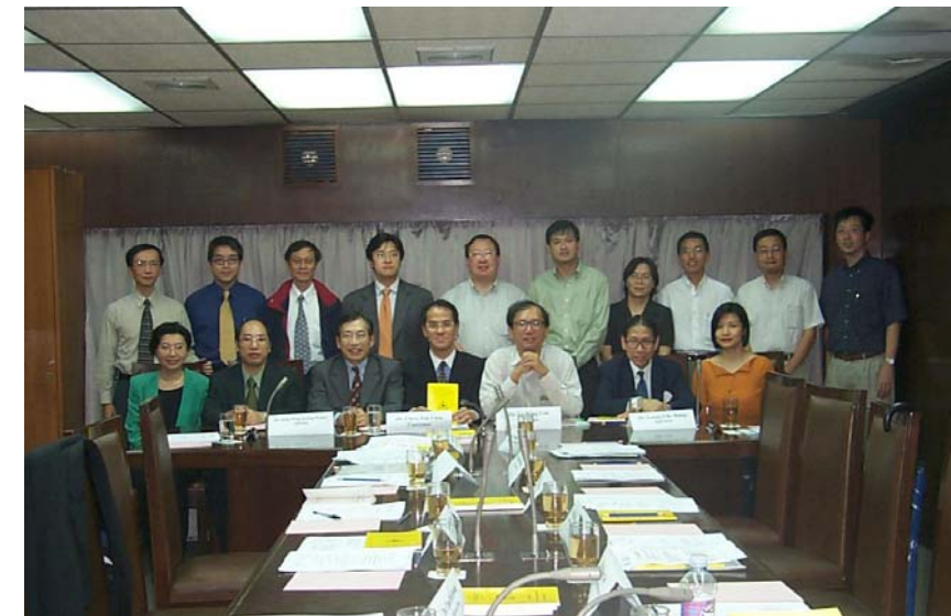
The Working Group in Revision of the Code of Practice – Health Care Laser System has held the first meeting on 19 July 2002