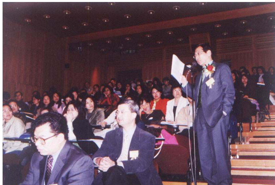
More than 200 participants were actively involved in the lecture and discussion at the Asian Laser Forum